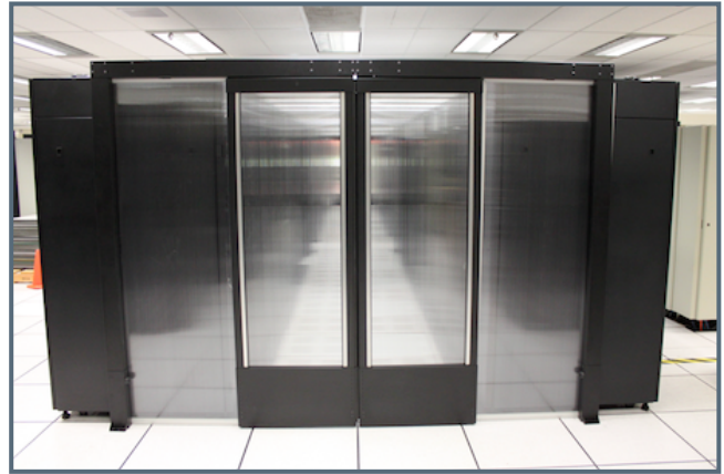
PolarPlex™ P2 Adjustable Height Sliding Door

Polargy is the leading manufacturer and turnkey solution provider of data center hot and cold aisle containment systems. We help our customers achieve successful outcomes for their airflow improvement projects. Polargy's containment systems are installed across the world with customers including Verizon, Facebook, Pixar Animation, and Dell.