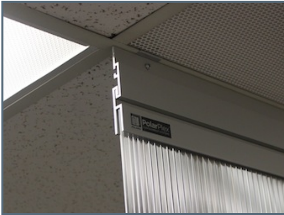
PolarPlex™ Suspended Panel System