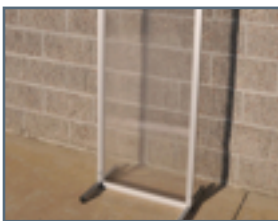
Self Standing Panels

The Standard Containment Panels are mounted to rack tops or to supporting Unistrut with the PolarPlex™ Mounting Brackets. These one eared brackets are simple to install and the panels just slide into the channel where they are held tightly in place.