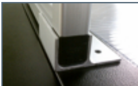
PolarPlex Mounting Bracket

The Containment Systems are lightweight, durable, and easy to handle. The panels are constructed of clear fire safe inserts secured with rigid aluminum tube framing. Panels are built to suit the specific site, or standard sizes can be ordered. Panels are secured to rack tops with the PolarPlex™ Mounting Bracket which provides quick install and quick removal.