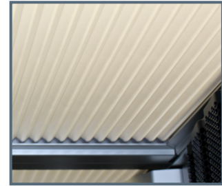
Drop-Away Panel Close Up