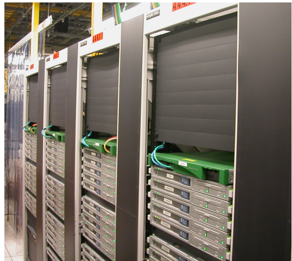
PolarDAM™ Air Dam Barriers Fill the Gaps Between Racks

The PolarDAM™ Air Dam Skirts and Barriers are fire retardant and meet the UL rating of UL-94-V0. The fire retardant polypropylene material is strong, chemical resistant and does not absorb moisture. It is RoHS compliant.